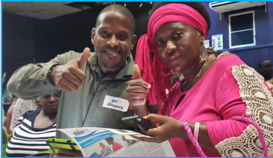
SZV representative and insured during Happiness Event on October 10, 2019.

Many persons in our community have had at least one contact moment with SZV. At any point in time, each person will have a different experience based on the service received. Over the past years, it has been our objective to improve the customer experience at each level of contact. At events for example, we are flexible to provide the information requested by those that visit our table but also offer new information and services. Most recently, we have introduced our "How well do you know SZV?" quiz. The quiz is a short and fun way to test your knowledge about your Social & Health