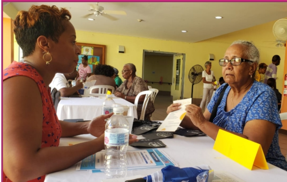
SZV representative sharing information during Golden Age Expo at White & Yellow Cross.

Senior services at SZV is a "hot topic". Conversations with our seniors are important to exchange ideas on the development of senior services. On the topic of "going digital", concerns are addressed relating to senior access to internet, computers and technical skills. While many new contact points are digital, the traditional means of contact remain. We are still one phone call away and when visiting our Seniors & Benefits desk; enjoy a hot cup of tea/coffee. Do you have ideas for our senior services? Contact us!