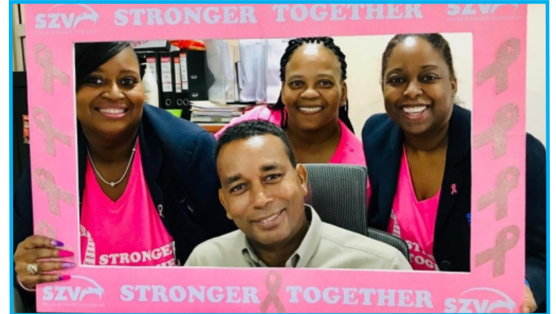
SZV Registration department staff during in-house Breast Cancer Awareness campaign.

The month of October is annually recognized as Breast Cancer awareness month. SZV's theme for this year's campaign is "Stronger Together", highlighting that awareness initiatives are most complete when united for the cause. Our staff was out in full force during the Pink Parade, hosted by the Positive and Elektralaytes Foundation. This year we also hosted an in-house breast screening for visiting SZV insured. Read more about the screening event on page 3.